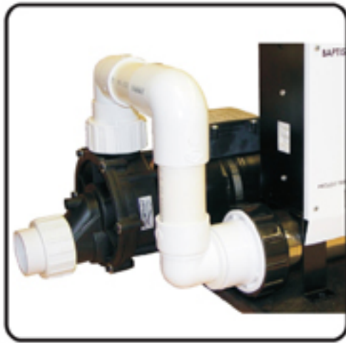
Fig. 4 - Install the pump to control box header assembly. Leave loose until everything is lined up properly.