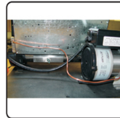
Fig. 5 - With everything mounted it is time to "Bond" the pump to the controls box. Use the included #8 bare copper wire to connect the pump to the control box.