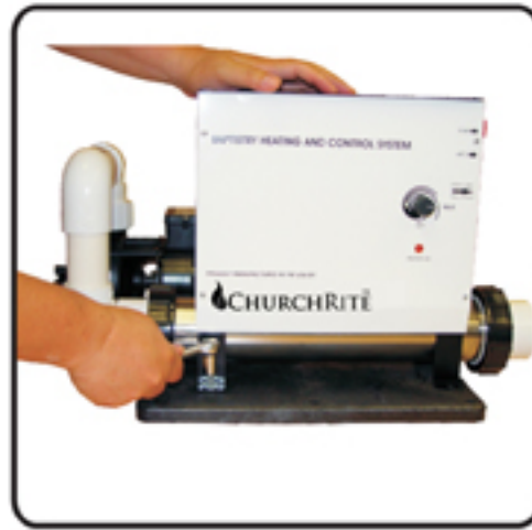
Fig. 4 - Now proceed to tighten all the mounting screws until secure.