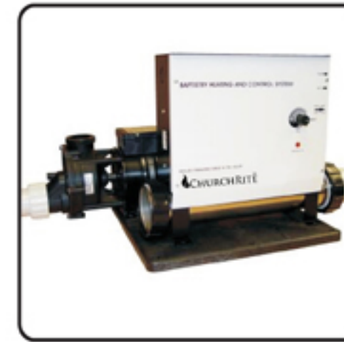
Fig. 3 - Position the control box on the base over pre drilled holes as shown and loosely install self tapping mounting screws.